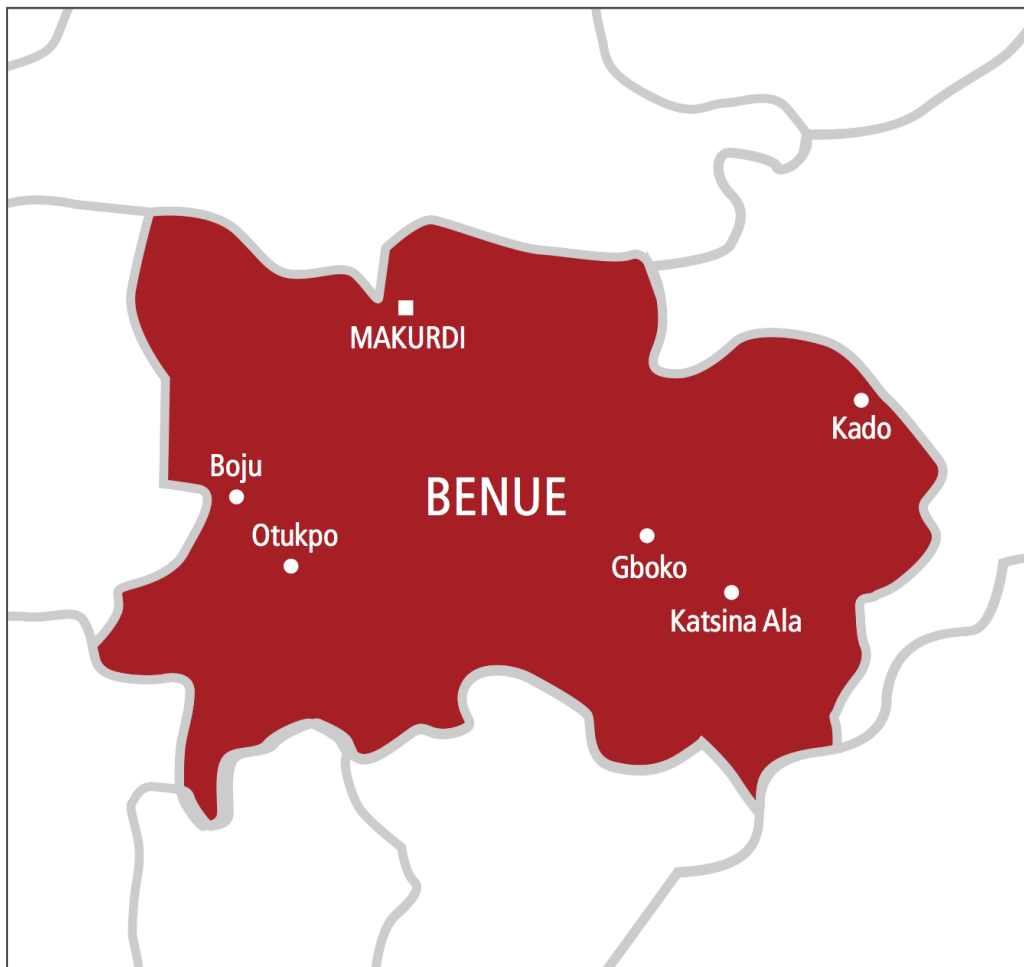
Map of Benue State