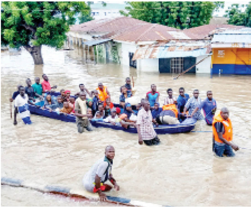
■ People affected by floods are escorted through flood water on a military boat in Maiduguri, Borno State yesterday