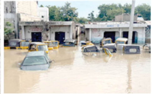
■ Gwange Bulabulum area, flooded