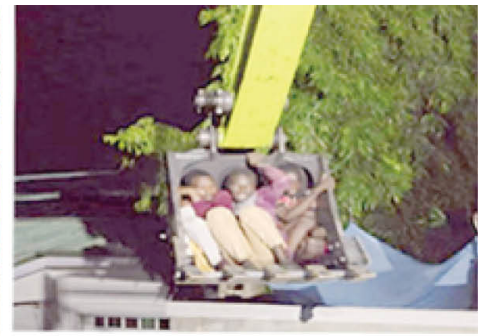
■ Children rescued in a crane from a rooftop as floodwaters submerged Polwaya Biyu, Maiduguri