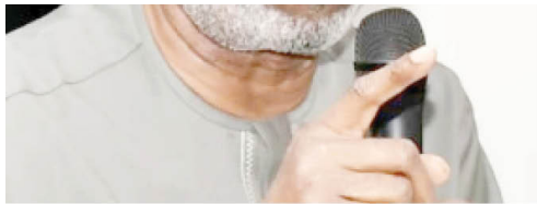
■ Minister of Solid Minerals Development, Dele Alake