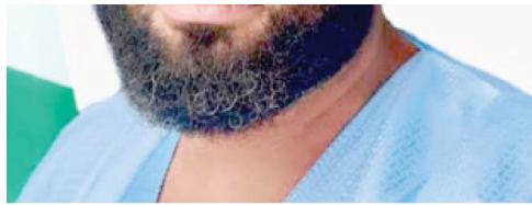
■ Niger State Governor, Umaru Bago