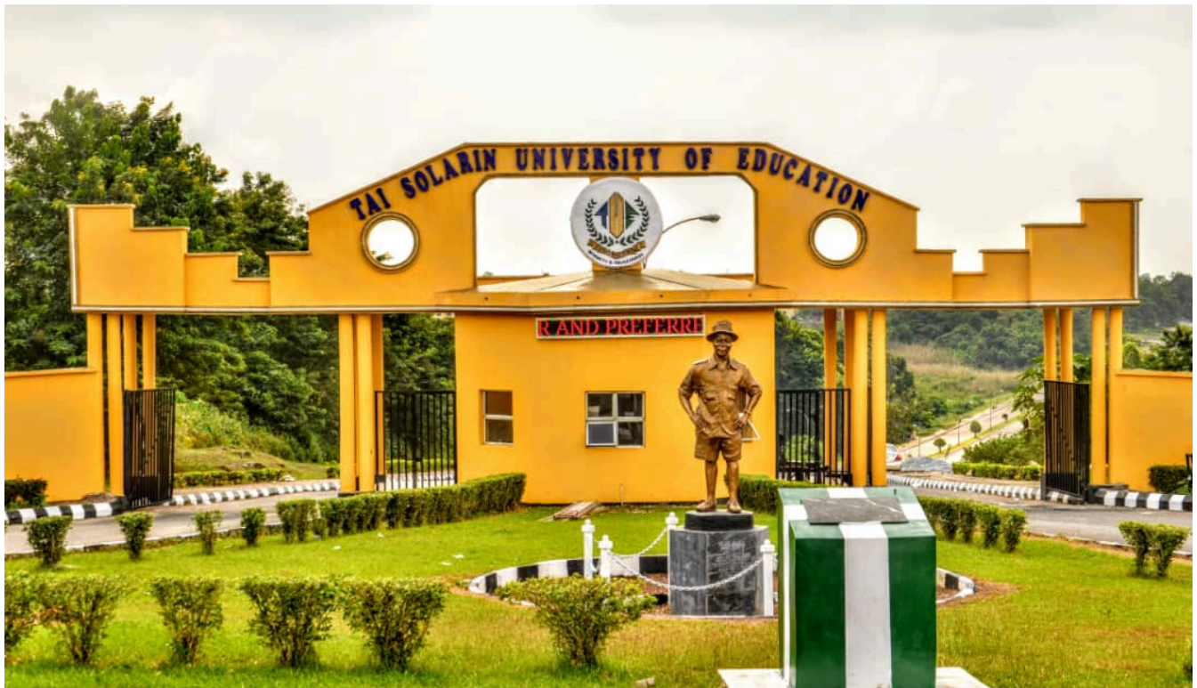
Tai Solarin University of Education (TASUED)