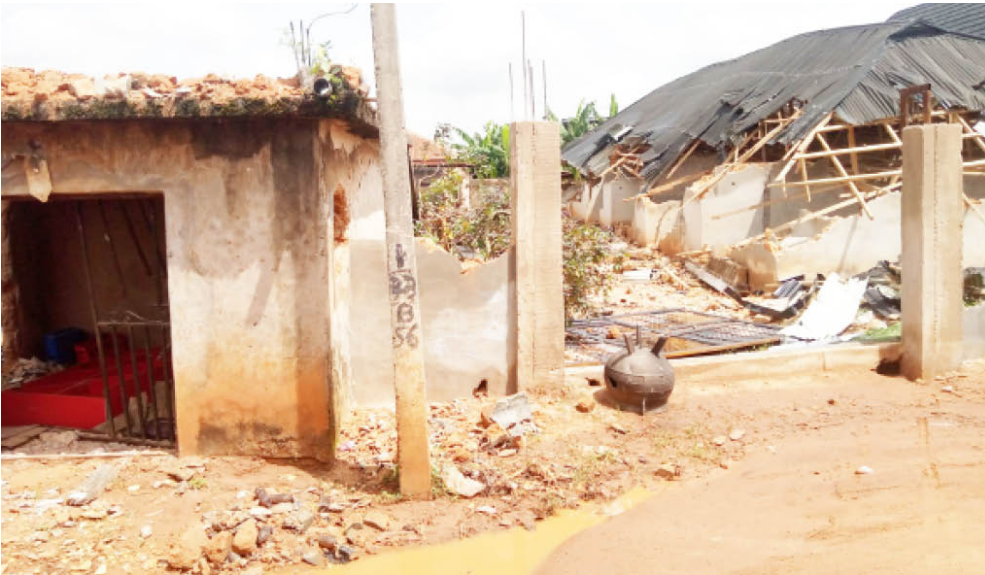
the burnt house of the suspect

Our reporter who visited the house of the suspected killer, located at Evbovoen (Love Power) Street, Opagha community, observed that it was completely razed by an irate youth after the incident.