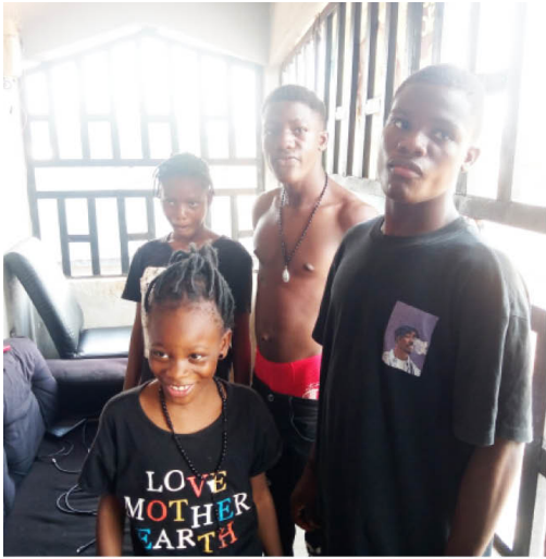
The deceased's children