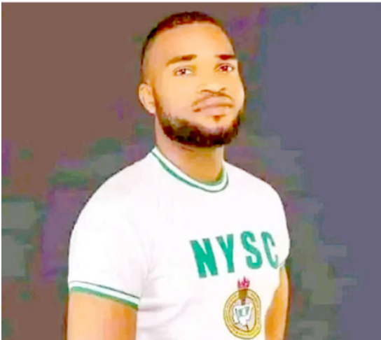
■ Best, the newly employed UBA staff who completed NYSC in June 2023

Witnesses said that at least eight people were killed during the attack on five banks simultaneously.