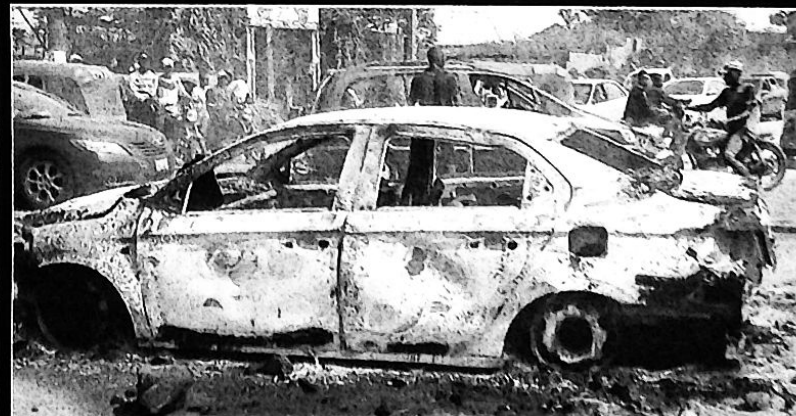
■ FRSC burnt car

It was a sad moment. We were just sitting down when suddenly we heard that a tanker had exploded. I counted more than ten bodies; many people have died