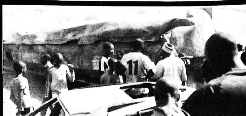
■ The tanker