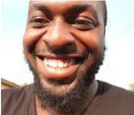
Lagos Millionaire Reveals: How to Make Money Working from Home Daily Finance