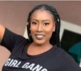
Better Than Tinder. Meet Nigerian Women Looking For Mature Men Dating