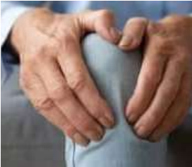
If You Have Joint Pain, Read It Before It Gets Deleted! Arthrazex