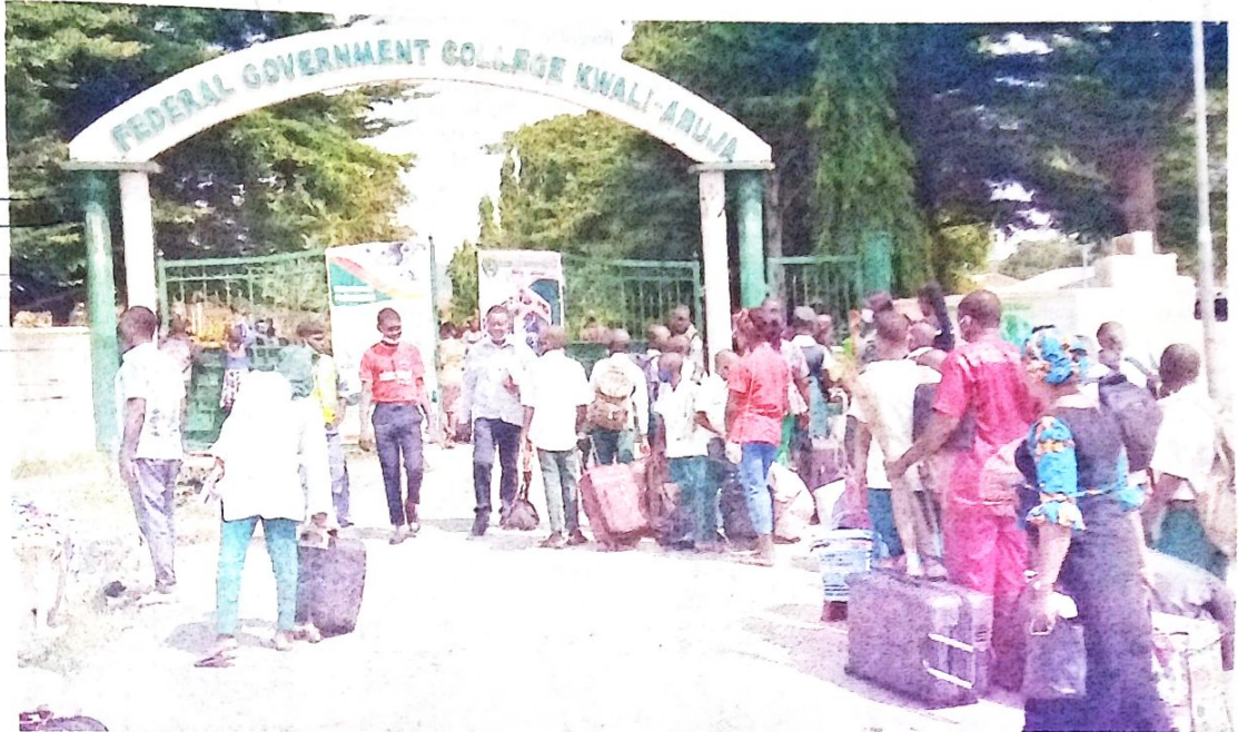
■ Students at the entrance of the college

She allegedly used the iron handle of a bucket to hit the student on his head for failing to do his assignment.