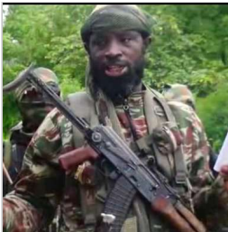
How ISWAP used women and teena... dailytrust.com