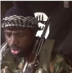
Inside details of ISWAP's mission t... dailytrust.com