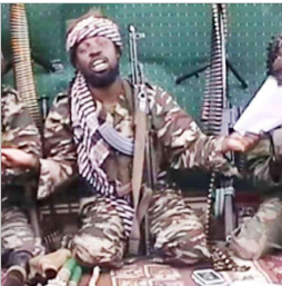
REVEALED: How Shekau, ISWAP co... dailytrust.com