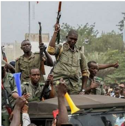
Coup rumours as Malian soldiers d... dailytrust.com