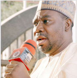
Breket family: BBC unmask the... dailytrust.com