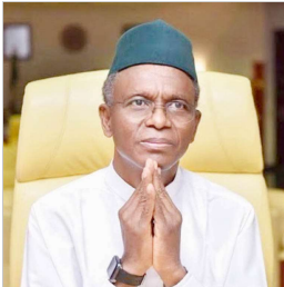
Strike: Total blackout in Kadu... dailytrust.com