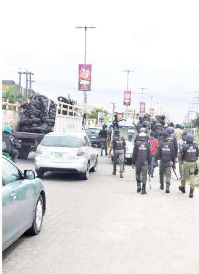
Recent enforcement of okada ban by the taskforce officials

A detachment of mobile police men and plain clothed officers were deployed to maintain law and order while roads leading to Mokuolu Street including Excellence Roundabout, Ogba Market to WAEC area were blocked with police truck from the Rapid Response Squad (RRS) unit.