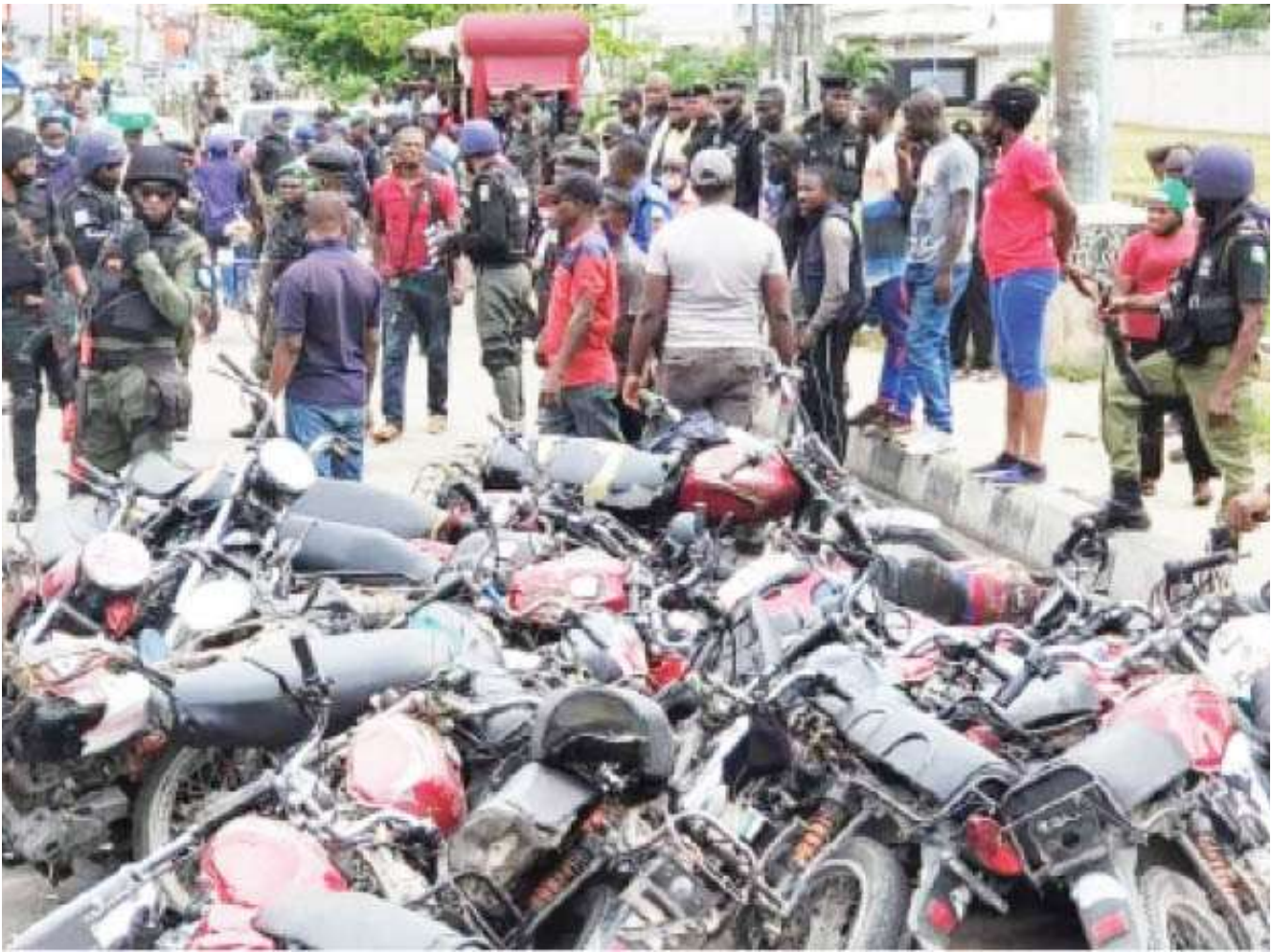
Some motorcycles seized by the policemen

The eyewitness said, “I wasn’t there when it happened. I only got here this morning and saw policemen everywhere. I later heard that the policemen wanted to arrest the Okada riders but they challenged them that it was not the proper time to seize their bike.