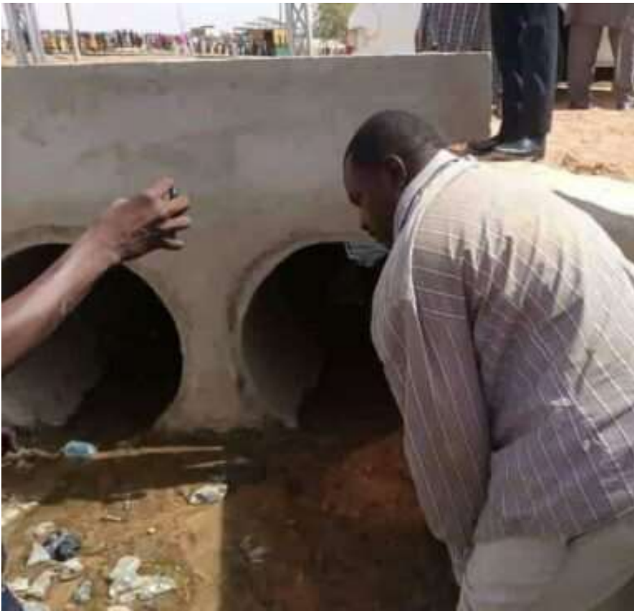
One of the arrested suspects leading the police to the drainage where the body was found

Sources in the area believe a neighbour connived with another resident, an ex-military personnel, to kidnap the boy.