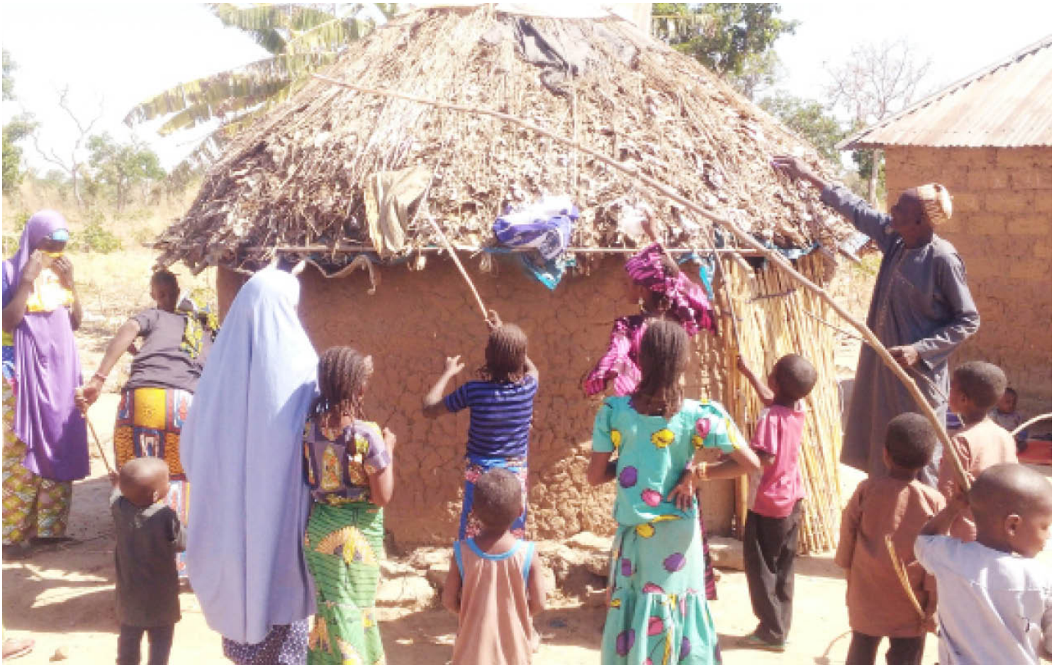
Fulani returnees from South South repairing their huts at Laduga Village, Kachia Forest, in Kaduna State yesterday