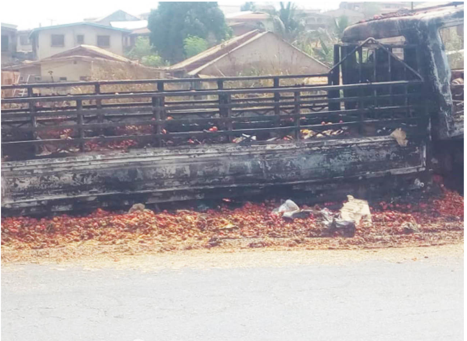
A burnt truck near Shasa market