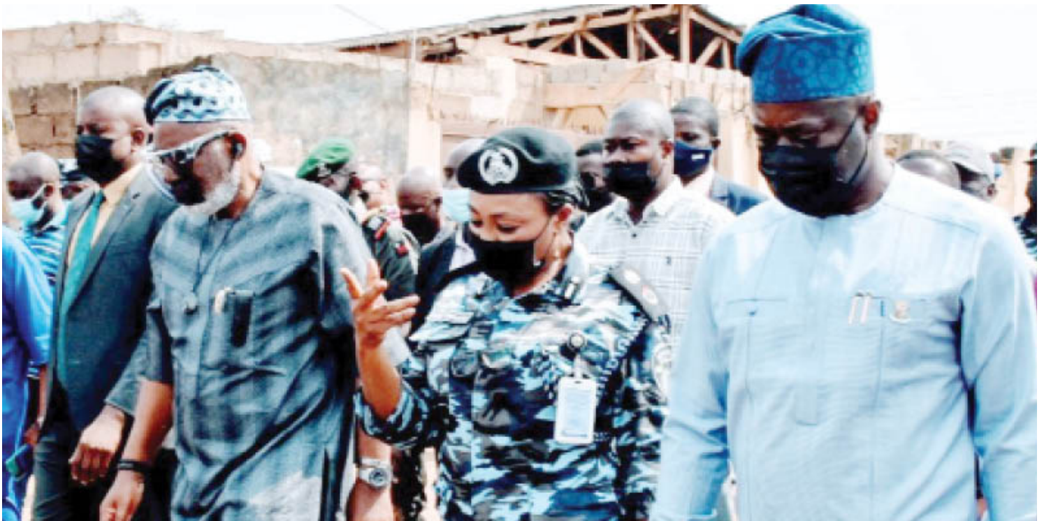
Governors Seyi Makinde and Rotimi Akeredolu on a visit to the troubled community, yesterday

The charred remains of 8 other people killed during the crisis were still at the police station in the Shasha area, as of Sunday evening.