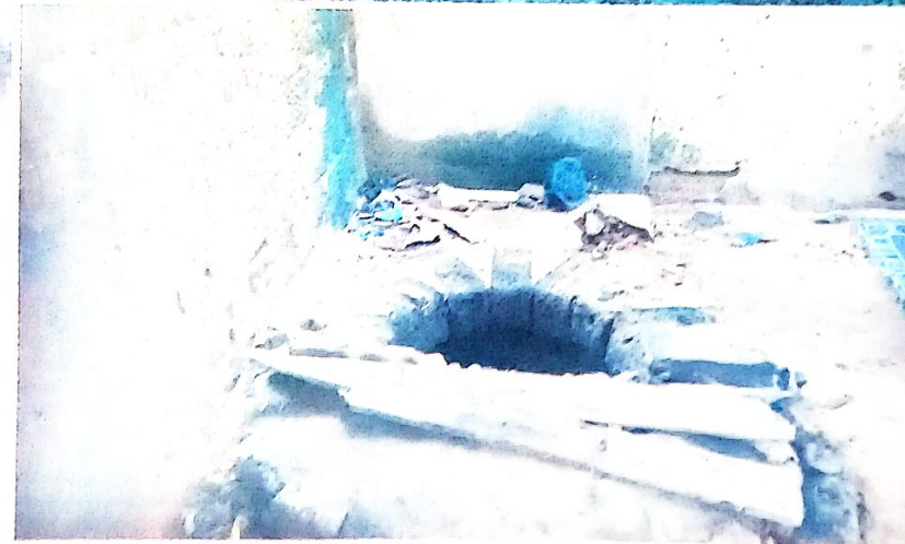
■ The well in which a butcher died while rescuing his sheep in Dambatta LGA