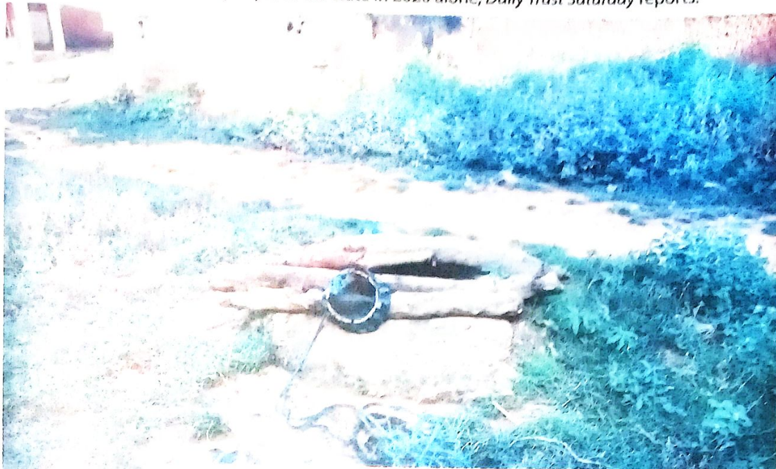
■ An open well in Yadaï village, Gabasawa LGA

Water shortages in Kano have seen residents turning to wells for water, but a trip to a well has meant death for at least 15 people in the state in 2020 alone, Daily Trust Saturday reports.