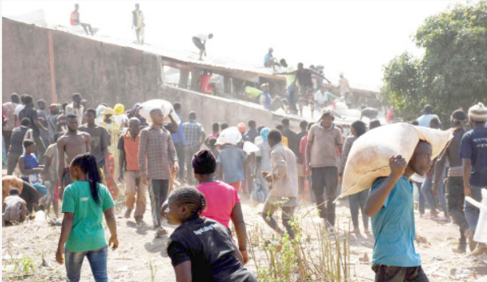
Some youths carrying looted bags of food palliatives after they broke into Plateau government warehouse in Jos on Saturday

Our correspondents gathered that five persons were feared dead in Edo and the same number in Taraba State while one person died in Anambra State.