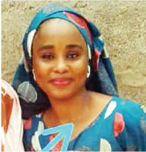
■ One of the deceased housewife