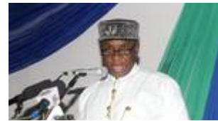
FG sets up team to unbundle railways

A security personnel attached to Operation Safe Haven said shells of AK47 ammunition, wraps of Indian hemp and bottles of illicit drinks were recovered from the scene.