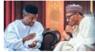
Osinbajo to act as Buhari begins vacation in