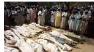
Banditry: Sokoto holds mass burial for 32 victims