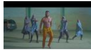
We will no longer sue Falz over 'This is Nigeria'