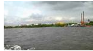
Unidentified woman jumps into Lagos lagoon

THE BREAKTHROUGH NATURAL CURE FOR YOUR PROSTATE ISSUES!!! YOUR PROSTATE ENLARGEMENT Is REVERSIBLE! Don't Let It Threaten You! This Is How To SHRINK And NORMALIZE Your PROSTATE Within 15 Days Without Surgery Or Chemical Drugs! Click Here!