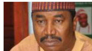
Former govs facing corruption charges