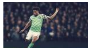
Eagles' World Cup jersey voted best