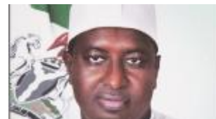
EFCC detains Kaduna former governor