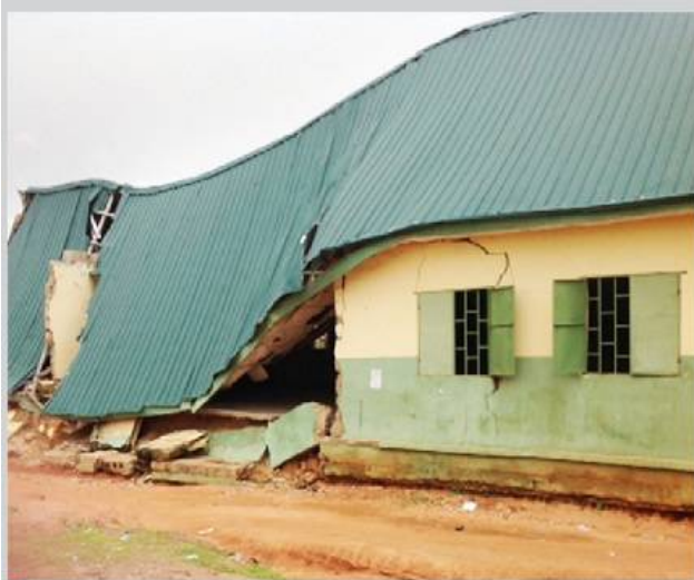
■ School is out: The collapsed structure