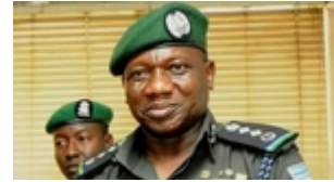
transmission video was doctored – IGP

2019: There's plot to 'knockout' Buhari –