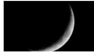
Ramadan fasting begins tomorrow – Saudi