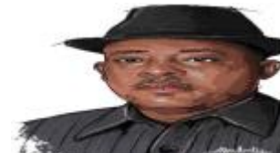
2019 presidency: PDP shops for serving gov