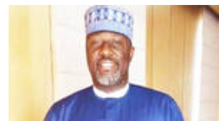
Court strikes out case on Melaye's assassination attempt