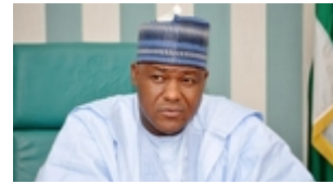
Dogara: We'll hold security agencies responsible