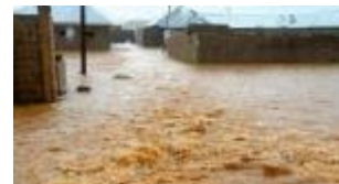
Rainstorm claims 2 lives in Kaduna