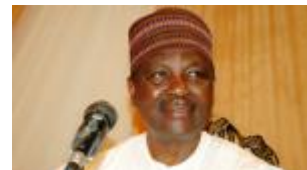
Gowon warns against impeaching Buhari