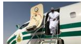
Buhari back after US trip