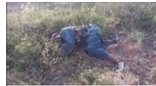
43 persons killed in Adamawa, Zamfara

"However, the local vigilantes resisted them and fought back resulting in the death of 13 people from both sides," he added.