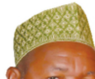
Katsina LG personnel tell Masari

BREAKING: Confusion as unknown men steal mace from