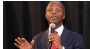
beneficiaries of Buhari's appointments

Nothing will stop my in-law from becoming gov —