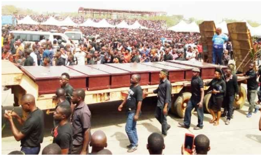
Some of the remains of 73 persons killed during an attack on Benue communities at Guma and Logo Local Government Areas, during their funeral service at the I.B.B Square in Makurdi yesterday.

Tears flowed freely yesterday as 73 people killed by gunmen at their homes in several rural communities of two local government areas of Benue State were finally interred in a mass grave in Makurdi.