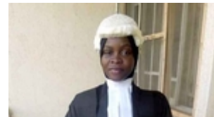
called to bar

Choice of presidential candidate takes centre stage at