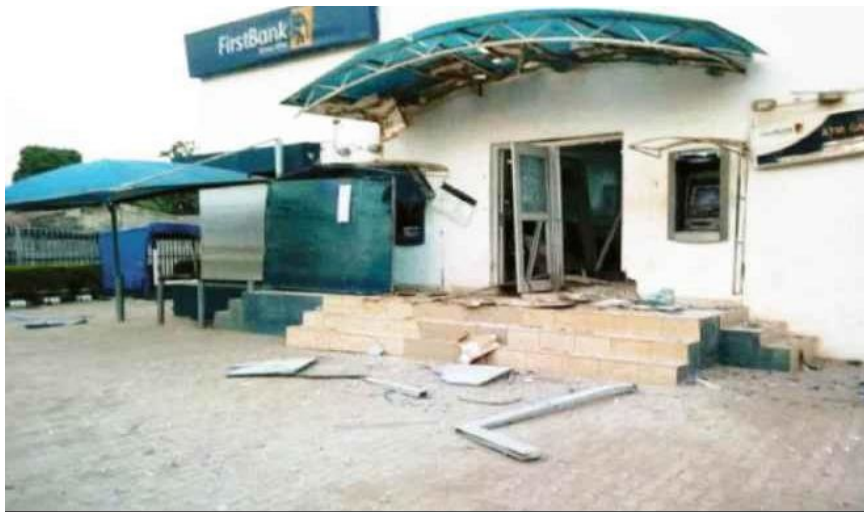
One of the banks attacked during the robbery.

The police in Niger State yesterday confirmed the killing of a police inspector and a civilian in a robbery operation in Lapai town, Lapai Local Government Area of the state.