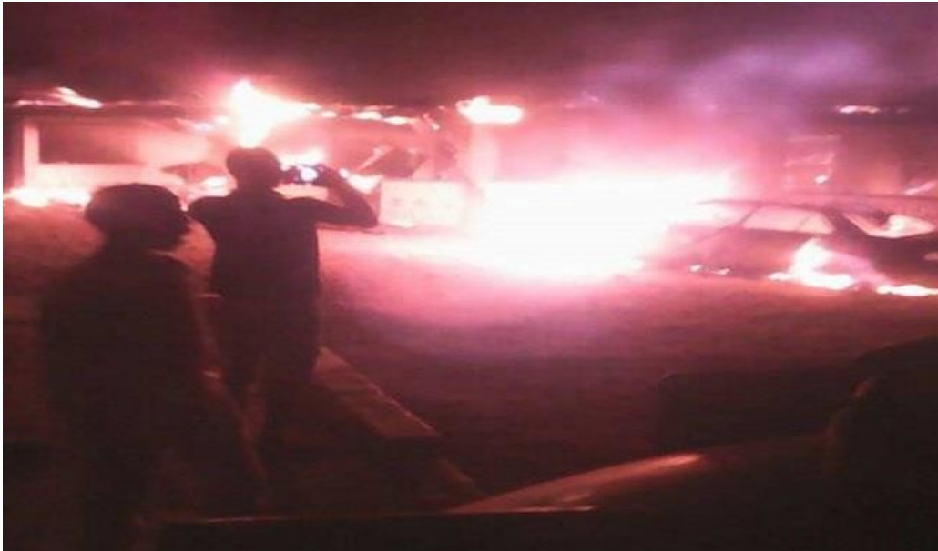
Senator Sha'ba Lafiagi house burnt down by irate youth in Lafiagi, Edu local government area of Kwara state.

Three people were confirmed dead by the Kwara state Command of the Nigerian Security and Civil Defence Corps (NSCDC) after angry youths attacked the residence of Senator Mohammed Sha'aba Lafiagi located in Lafiagi area, Edu Local Government.