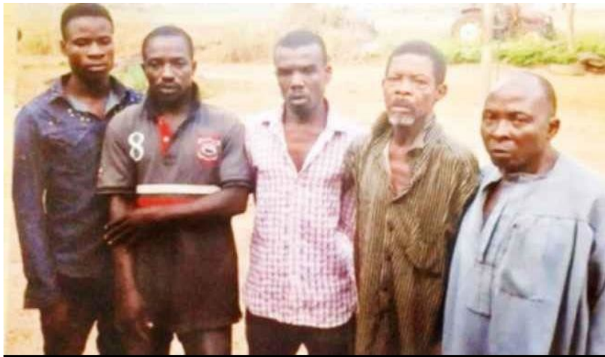
From right, the two native doctors and the three others arraigned with them