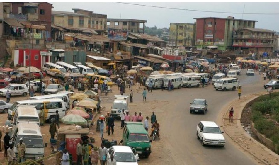
File photo: Ancient city of Ibadan, Oyo state