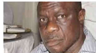
Ex-Kogi acting governor dumps APC