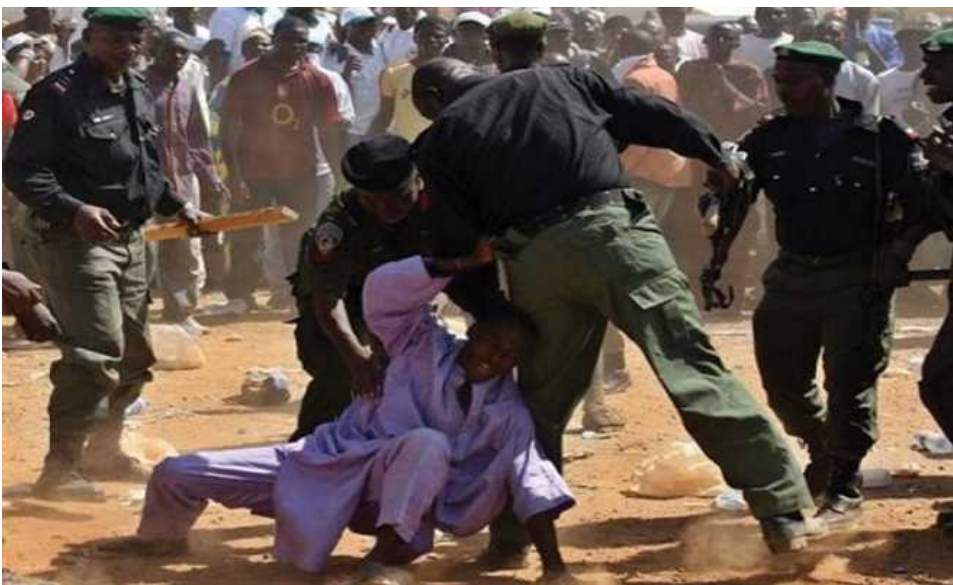
File Photo: Police rough handle citizen

Two persons were reported dead at the weekend following a clash between the police and a vehicle driver at Tarzan junction, Nkpor,