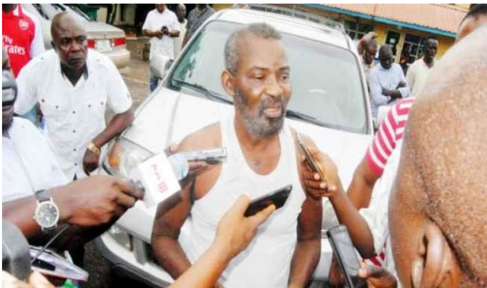
Herbalist paraded by Lagos police at the Ikeja command yesterday.