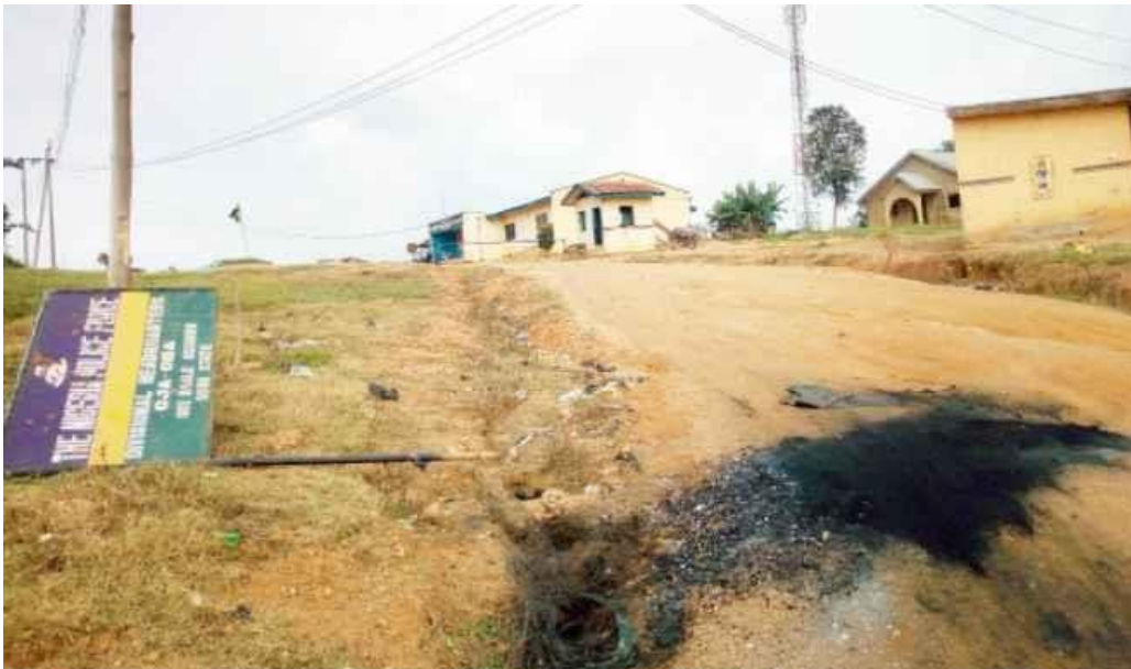
The destroyed sign post of the Oja Oba Police Station