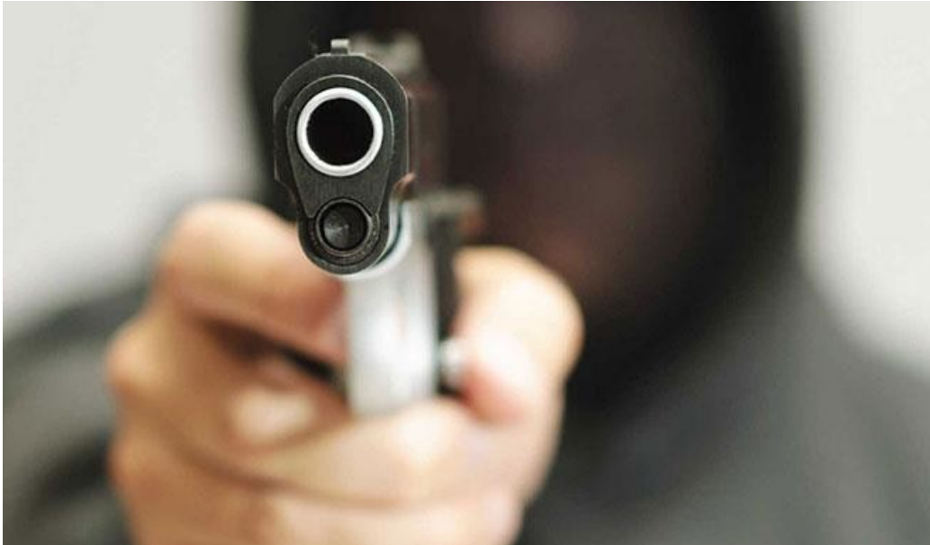
n The Fulani settlement (ruga) where a herder was killed and a housewife abducted.

Residents of the sleepy Gulida Community in Abaji area council of the FCT were recently thrown into confusion following the death of a herder and abduction of a housewife by gunmen suspected to be kidnappers.