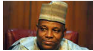
Black Monday for food snatchers in Maiduguri