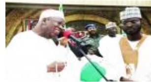
Buhari speaks with Ganduje during prayer session