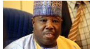
Sheriff moves to PDP secretariat