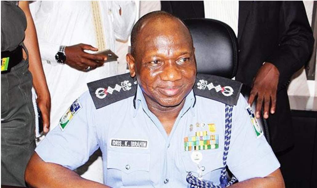
Acting Inspector General of Police Mr Ibrahim Kpotun Idris