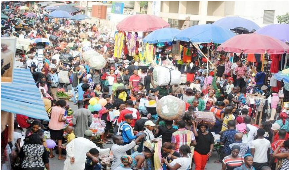
People shop for Christmas at the Balogun Market in Lagos yesterday.

In spite of efforts and assurances for an accident-free festive period by officials of the Federal Road Safety Corps (FRSC) Daily Trust findings show that road crashes persist along high ways across the federation. The performance report of the FRSC obtained by Daily Trust