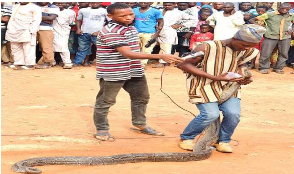
A snake charmer gives water to a snake in Utako, Abuja yesterday.

In the past two weeks, more than 50 farmers in communities in Kanke and Kanam Local Government Areas of Plateau State, have been bitten by snakes, lawmaker representing the area said.