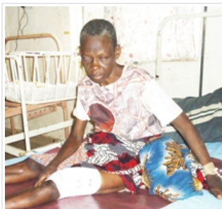
An elderly woman, who was shot on the leg by the rustlers during the operation at the community.