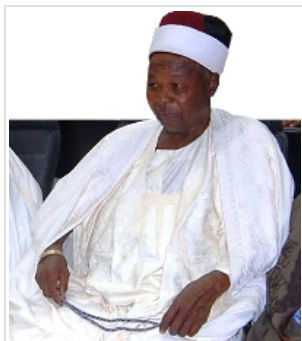
The late Emir of Gwoza