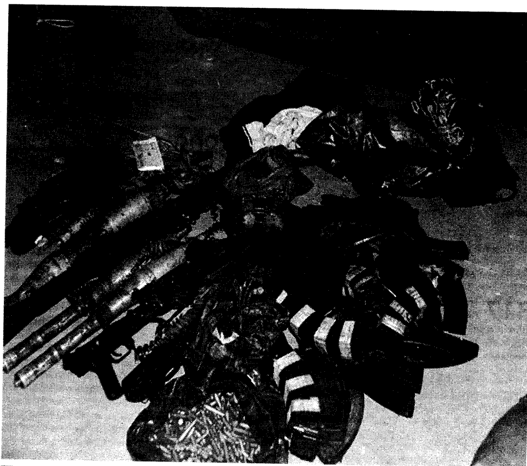
■ Ammunitions recovered from robbers in Benue State

Sunday Trust gathered that the gang had, at the early hours of Thursday, barricaded the Aliade-Otukpo road, few kilometres from Aliade town and unleashed