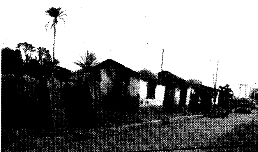
Shops along the main street in Ibi burnt down during the sectarian crisis

Uneasy calm has returned to the town with the imposition of a 24-hour curfew on Monday, but life will no longer be the same for adherents of the two religions who, before now, have co-existed peacefully as there will