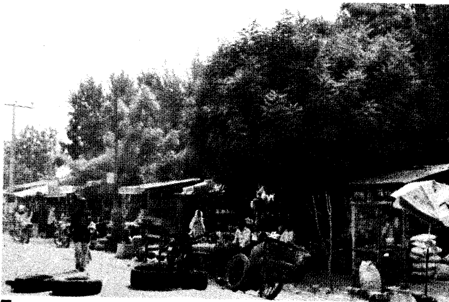
■ Remnants of tyres that were set on fire