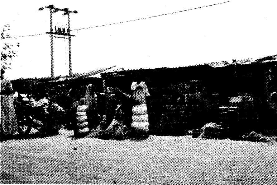
■ Normalcy gradually returning to Bichi