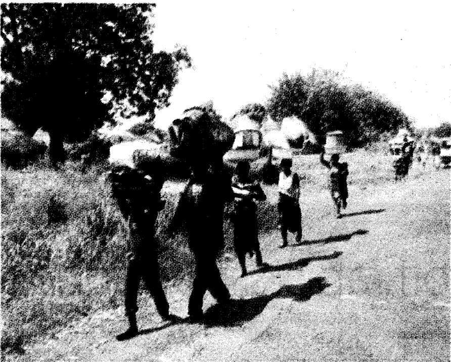
Residents of Ibi fleeing to neighbouring villages

There are reports of violence still going on in the villages around Ibi especially at night but the police said that it is just speculation.