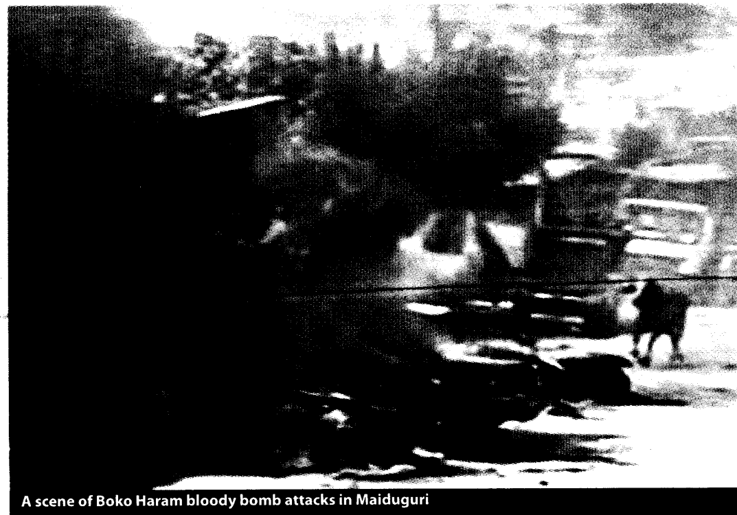
A scene of Boko Haram bloody bomb attacks in Maiduguri