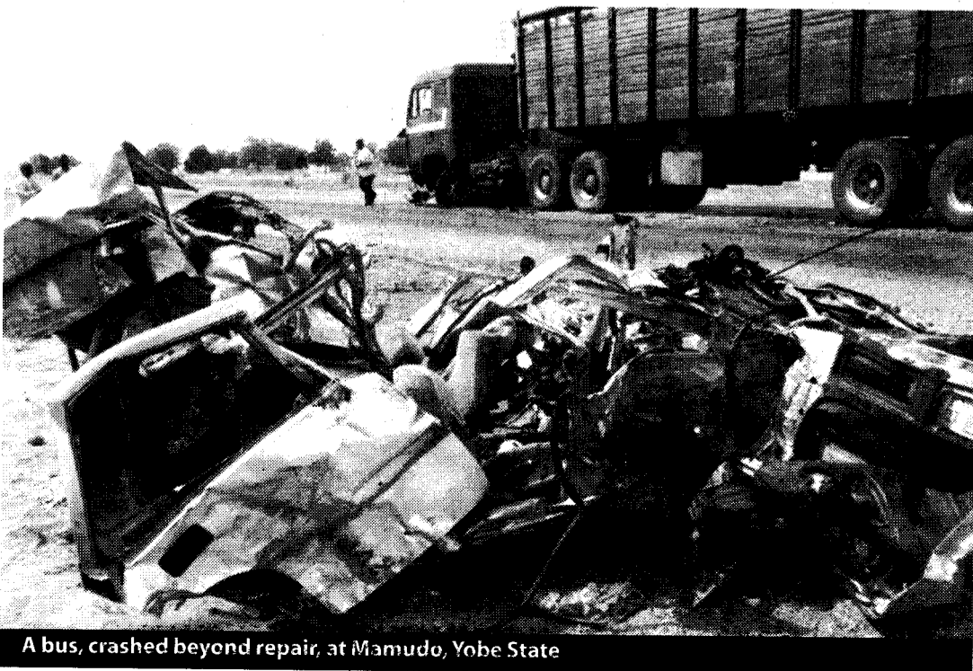
A bus, crashed beyond repair, at Mamudo, Yobe State

The then Obasanjo-led government had awarded a contract for the dualisation of the Kano-Maiduguri road and the project is still ongoing even as the government has stealthily ignored the Kari-Potiskum portion of the highway, a place motorists interchangeably describe as "the axis of death."