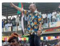
Sudan Elections Set to Go Ahead Amid Concerns