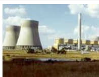
World Bank Loan Energises South Africa's Eskom