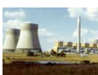
World Bank Loan Energises South Africa's Eskom