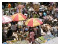
Economic Partnership Agreements and African Democracy