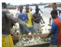
Illegal Fishing Threatens Africa's Food Security