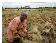
African Experts Showcase Drive to Double Rice Production