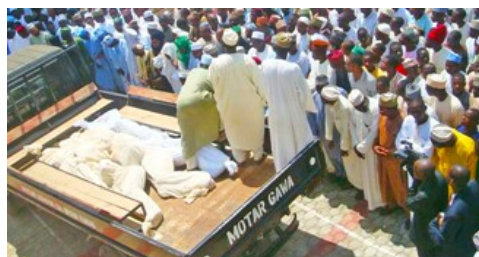
Funeral prayers being held for the accident victims

Thirteen teenage students between the ages of 15 and 19 were burnt to death on Saturday night when two speeding cars in which they were travelling collided and rammed into a pedestrian bridge at Gyadi-Gyadi on the Zaria Road in Kano metropolis. Only one of the occupants of the cars survived the crash with first degree burns when the two vehicles burst into flames immediately after the collision.